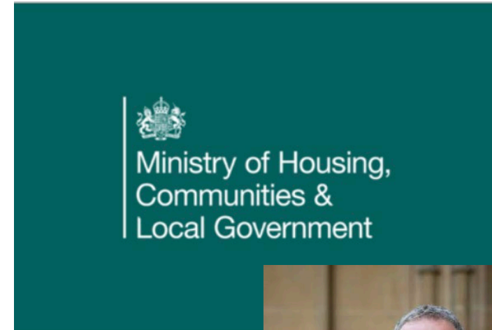
Steve Reed MP

I) Such other purpose as may be specified of the Department for, Housing, Communities and Local Government